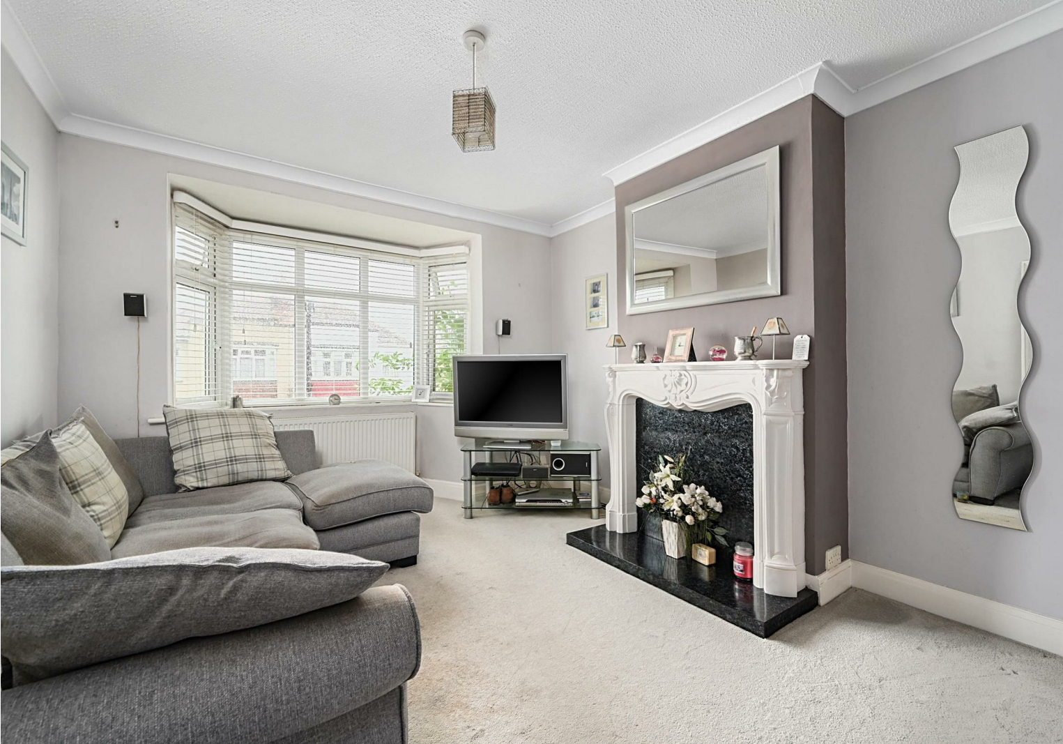
Southdown Road, BN41 Approximate Gross Internal Area = 78.1 sq m / 841 sq ft

A popular residential road close to Portslade Village centre and within just a few minutes' drive of both the A27 and the Old Shoreham Road. Local buses provide regular services to Portslade Town centre and mainline railway station, Hove and Brighton. The Holmbush Centre and Sainsbury's West Hove store are also both within a few minutes drive